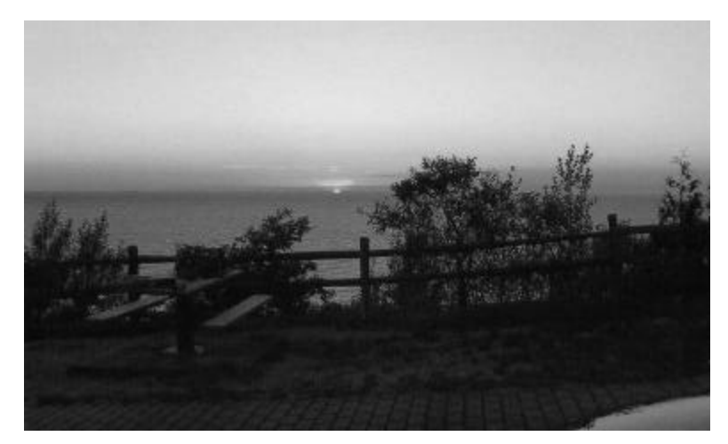
Arcadia, MI A Very Rover Friendly Site

Then a shot of my basement station- VHF operating position.